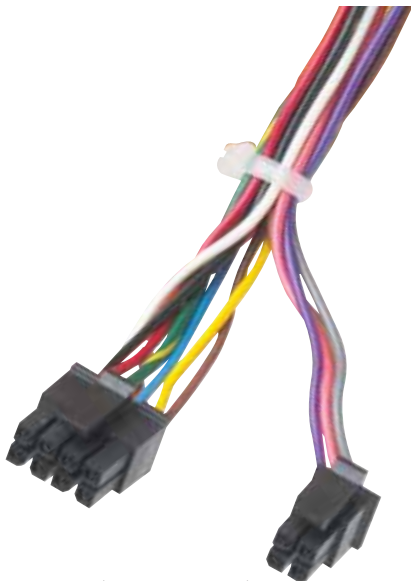
(Not actual size)