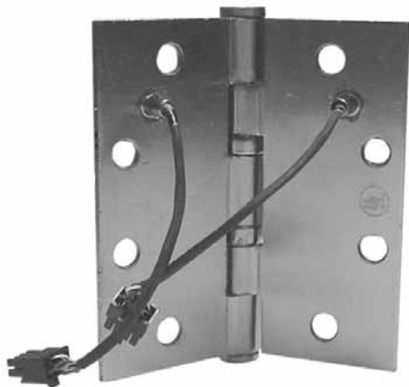
4.5" x 4.5" TA2714 26D QC-4 To order any ElectroLynx quick connect hinge, please use the QC suffix. See back for details.